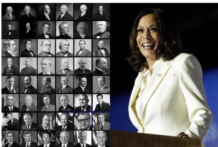
Created by the Center for American Women and Politics

Eagleton's Center for American Women and Politics (CAWP) released the following statement about Kamala Harris becoming the first woman and first woman of color to be elected as vice president.