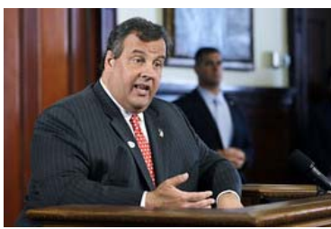
New Jersey Gov. Chris Christie answers a question during a news conference in June.

Gov. Chris Christie continues to enjoy high overall approval ratings in New Jersey, but partisan divides have started to open up on his stewardship of state issues such as the economy, according to a new poll.