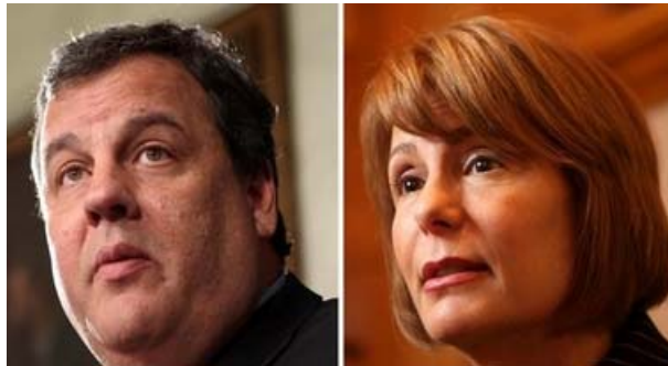
View full size ( http://media.nj.com/politics_impact/photo/christiebuonosplitjpg-e6e3529e7ef9a8cd.jpg )

( http://www.nj.com/politics ) — Voters prefer Gov. Chris Christie to state Sen. Barbara Buono by a 3-to-1 margin, but the Republican incumbent's coattails do not extend to the Legislature, according to a poll released today.