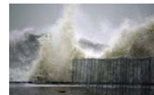
Shore gets Battered again