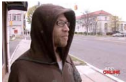
Asbury Park Trayvon Martin Comments (4/11/12) Apr 11, 2012