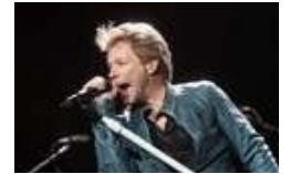
Final Day at Bamboozle Part II