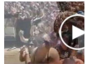
Bamboozle Saturday (05) May. 19, 2012