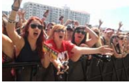
Bamboozle Sunday (5/20/12) May 20, 2012