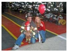
IMG_7731_edited.jpg Browse Album